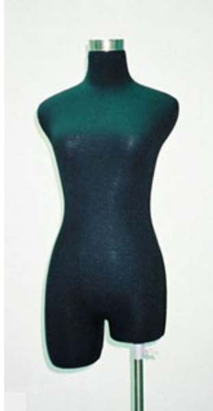
Item MS002. Bust with stand – Female Body, Black Color 半身模特兒連企座 – 女身，黑色