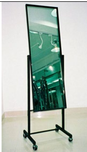
Item MS005. Movable Mirror 活動企身鏡